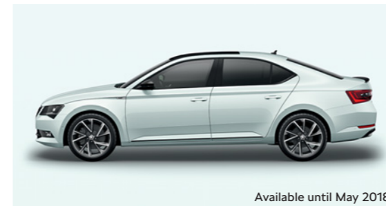
LASER WHITE UNI

Most engines feature the Start-Stop system and energy recovery functionality.