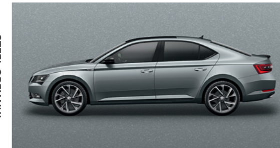
BUSINESS GREY METALLIC