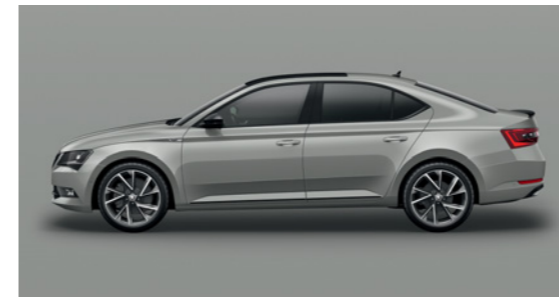
STEEL GREY UNI